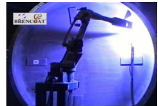
Crucible Lid with BR-4®